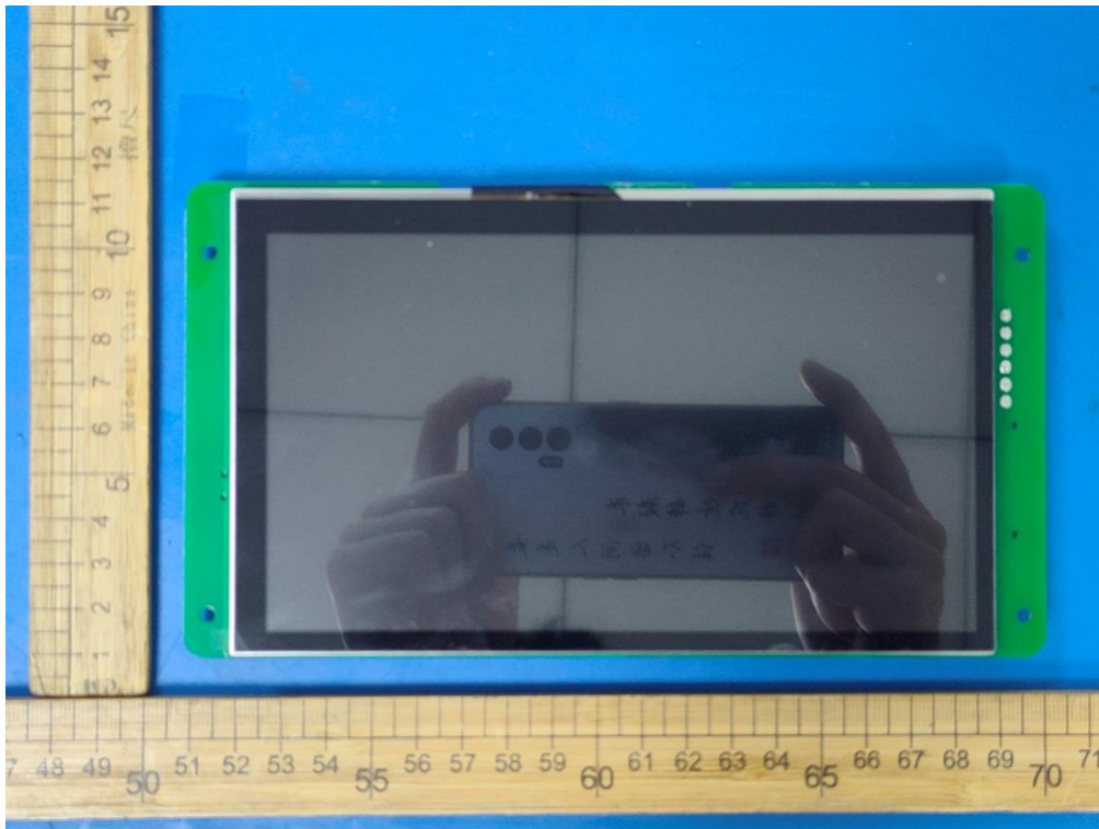
Fig. 1 -- Over view of EUT